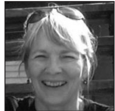
PAT STREET WEDNESDAY 10:00-11:00